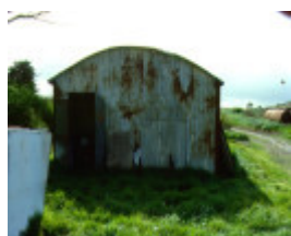
Prefabricated Cottage Side Elevation August 2001