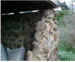
Prefabricated Iron Building Stables Rubble Wall