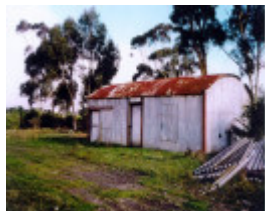
H01971 1 prefabricated iron cottage exterior