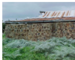
Prefabricated Cottage Stables