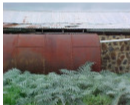
Prefabricated Cottage Boiler