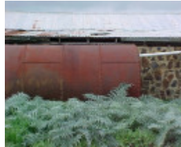
Prefabricated Cottage Boiler