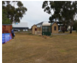
Context showing Harricks Cottage with the demounted prefabricated building under the tarpaulin May 2018