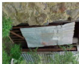
Prefabricated Cottage Stables Gate