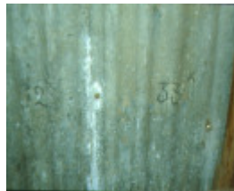
Prefabricated Cottage Iron Numbering September 2001