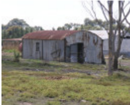
PREFABRICATED BUILDING SOHE 2008