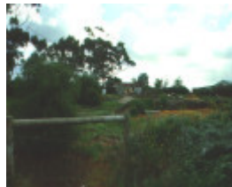
Prefabricated Cottage Context September 2001