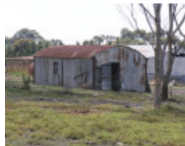
PREFABRICATED BUILDING SOHE 2008