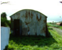
Prefabricated Cottage Side Elevation August 2001