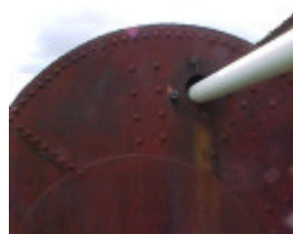
Prefabricated Cottage Boiler