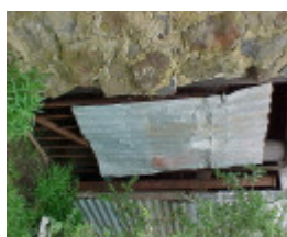
Prefabricated Cottage Stables Gate