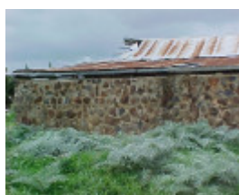
Prefabricated Cottage Stables