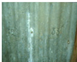
Prefabricated Cottage Iron Numbering September 2001