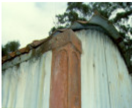
Prefabricated Cottage Corner Detail September 2001