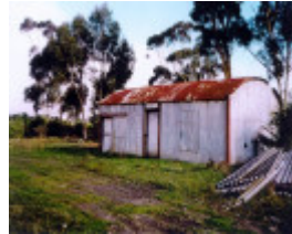
H01971 1 prefabricated iron cottage exterior