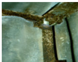
Prefabricated Cottage Interior Corner Detail September 2001