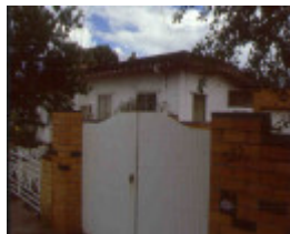
Concrete House Port Melbourne November 1999