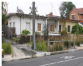
EXPERIMENTAL CONCRETE HOUSES SOHE 2008