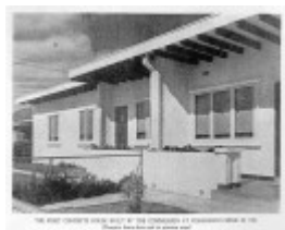
1 concrete houses vhc 1943 annual report