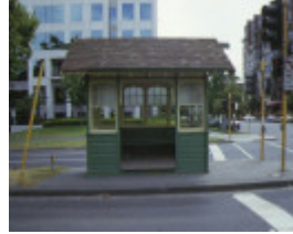
1 tram shelter cnr st kilda rd and lorne st melbourne east elevation dec1999