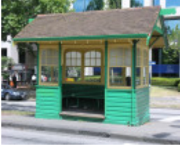
TRAM SHELTER SOHE 2008