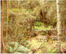
leichardt gold crushing battery