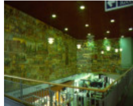
1 history of transport mural 2000