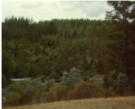
1 sawpit gully landscape H1951 march2000