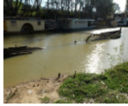
20151005_Echuca wharf Wet Dockand B22 Barge 8.JPG