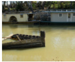
20151005_Echuca wharf Wet Dockand B22 Barge 11.JPG