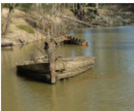
20151005_Echuca wharf Wet Dockand B22 Barge 15.JPG