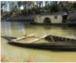
20151005_Echuca wharf Wet Dockand B22 Barge 9.JPG