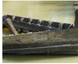
20151005_Echuca wharf Wet Dockand B22 Barge 13.JPG