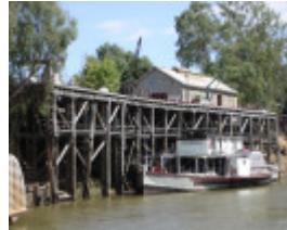
Echuca Wharf Jan 2006 mz View From Murray River