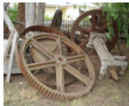
Remnant log winch mechanical parts - gears. March 2007.