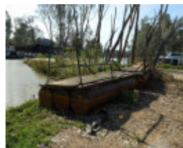
20151005_Echuca wharf Wet Dockand B22 Barge 4.JPG