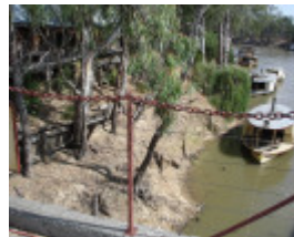
Echuca Wharf Jan 2006 mz Remnant Structure to North of Extant Wharf 01