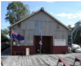
Echuca Wharf Jan 2006 mz Cargo Shed and State Border