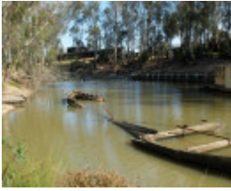
20151005_Echuca wharf Wet Dockand B22 Barge 2.JPG