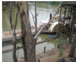
Echuca Wharf Feb 2008 mz Remnant Structure to North of Extant Wharf 02