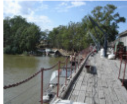
Echuca Wharf Jan 2006 mz View Along Wharf to Wet Dock