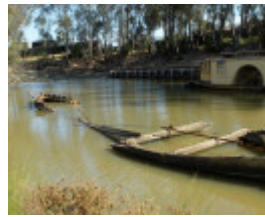
20151005_Echuca wharf Wet Dockand B22 Barge 10.JPG