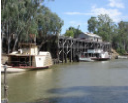
Echuca Wharf Jan 2006 mz Setting