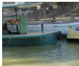
20151005_Echuca wharf Wet Dockand B22 Barge 16.JPG