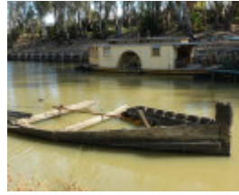
20151005_Echuca wharf Wet Dockand B22 Barge 3.JPG