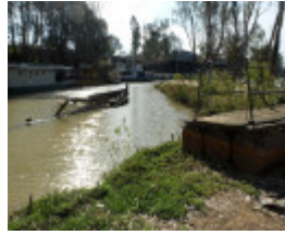
20151005_Echuca wharf Wet Dockand B22 Barge 5.JPG