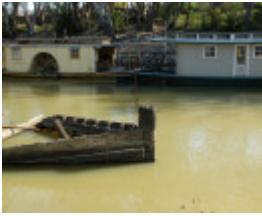
20151005_Echuca wharf Wet Dockand B22 Barge 12.JPG