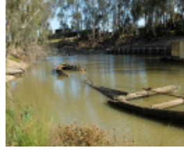
20151005_Echuca wharf Wet Dockand B22 Barge 7.JPG