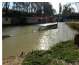
20151005_Echuca wharf Wet Dockand B22 Barge 17.JPG