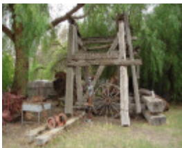
Log winch at the brothels site, relocated from the Evans Brothers Sawmill. March 2007.