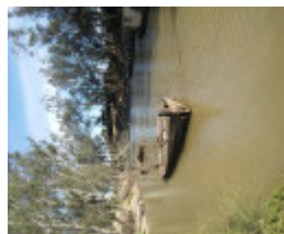
20151005_Echuca wharf Wet Dockand B22 Barge 1.jpg