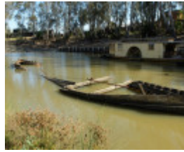
20151005_Echuca wharf Wet Dockand B22 Barge 14.JPG