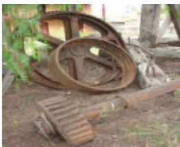
Remnant log winch mechanical parts - gears and counter shaft. March 2007.