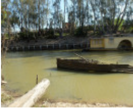
20151005_Echuca wharf Wet Dockand B22 Barge 6.JPG