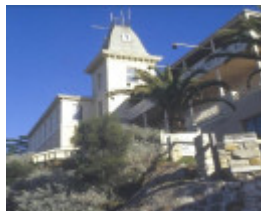
cotidental hotel ocean beach road sorrento side view she project 2003