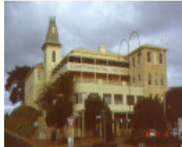
1 Continental Hotel