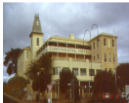
1 Continental Hotel