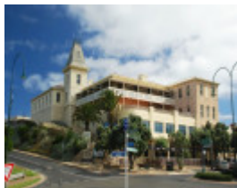
CONTINENTAL HOTEL SOHE 2008