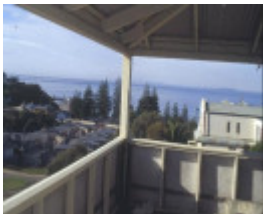
cotinental hotel ocean beach road sorrento top floor view she project 2003