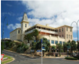
CONTINENTAL HOTEL SOHE 2008