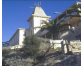
cotinental hotel ocean beach road sorrento side view she project 2003