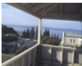
cotidental hotel ocean beach road sorrento top floor view she project 2003