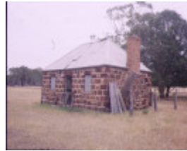
fulham balmoral horsham rd kanagulk overseer's cottage nov1994