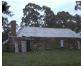
fulham balmoral horsham road kanagulk shearers shed nov1980