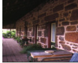
fulham balmoral horsham rd kanagulk front verandah nov1994