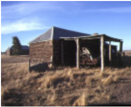
fulham balmoral horsham rd kanagulk woolshed complex feb1980