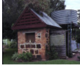
fulham balmoral horsham rd kanagulk meat house nov1980