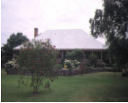
1 fulham balmoral horsham rd kanagulk front view homestead nov1994