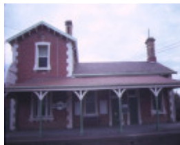
1 kangaroo flat railway station complex front elevation jul1984