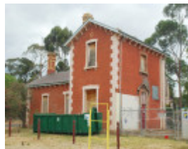
KANGAROO FLAT RAILWAY STATION COMPLEX SOHE 2008