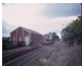
kangaroo flat railway station complex goods shed jul1984