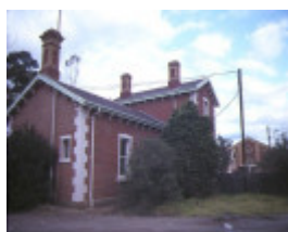
kangaroo flat railway station complex rear view jul1984