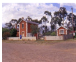
Kangaroo Flat Railway Station Complex Street Elevation