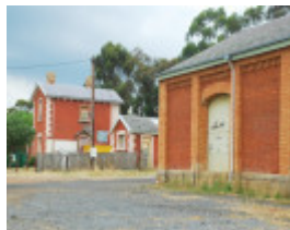
KANGAROO FLAT RAILWAY STATION COMPLEX SOHE 2008