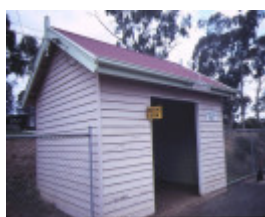
kangaroo flat railway station complex outbuilding jul1984