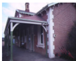
kangaroo flat railway station complex platform view jul1984