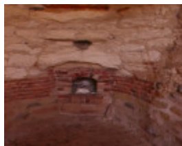
H01931 Duffy s Interior kiln