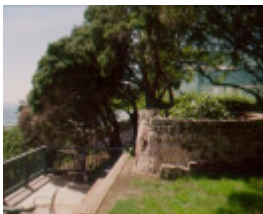
H01931 Duffy s Top kiln