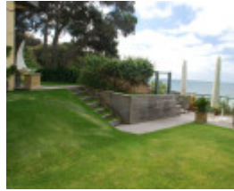
DUFFY'S LIME KILN SOHE 2008