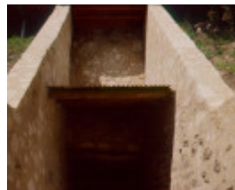
H01931 duffy s front kiln