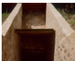
H01931 duffy s front kiln