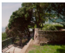
H01931 Duffy s Top kiln