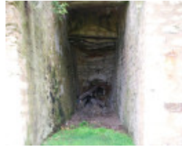
DUFFY'S LIME KILN SOHE 2008