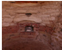
H01931 Duffy s Interior kiln