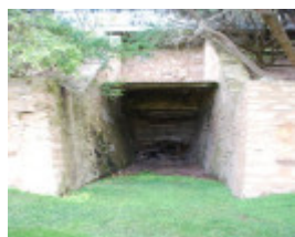
DUFFY'S LIME KILN SOHE 2008