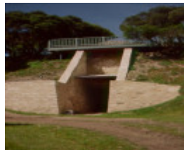
H01931 Duffy s kiln