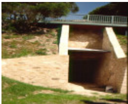
1 duffy's lime kiln