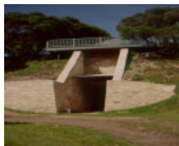
H01931 Duffy s kiln