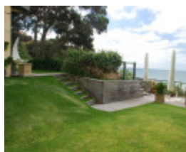
DUFFY'S LIME KILN SOHE 2008