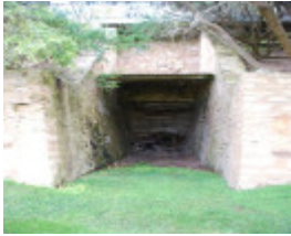
DUFFY'S LIME KILN SOHE 2008