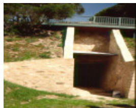
1 duffy's lime kiln