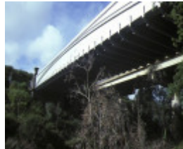
iron bridge maribyrnong river side elevation sep1984