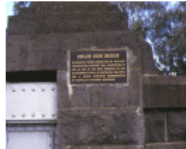
iron bridge maribyrnong river plaque detail