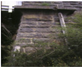
iron bridge maribyrnong river stone support detail