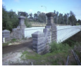
1 iron bridge maribyrnong river front view sep1984