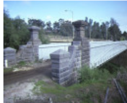
1 iron bridge maribyrnong river front view sep1984