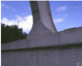
iron bridge maribyrnong river detail of iron siding