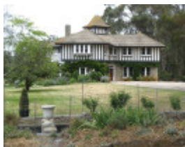
Westerfield_house garden lily pond_KJ_Dec 08