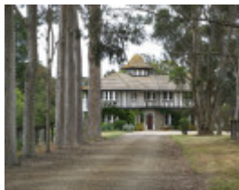
Westerfield_house from drive_KJ_Dec 08