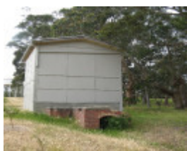
Westerfield_drying shed & furnace_KJ_Dec 08