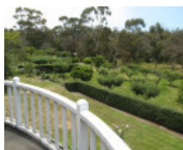
Westerfield_Frankston_north end of orchard & hedge from balcony_KJ_Dec 08