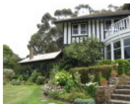
Westerfield_caretaker's cottage & garden front_KJ_Dec 08