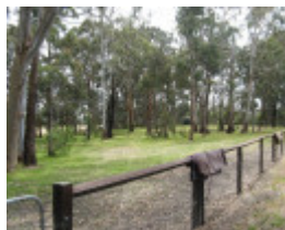
Westerfield_Frankston_eucalypt paddock_KJ_Dec 08