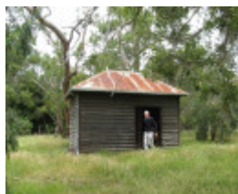
Westerfield_pump shed_KJ_Dec 08