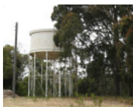
Westerfield_Frankston_elevated water tank_KJ_Dec 08