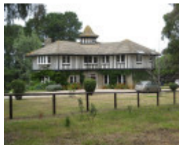
Westerfield from north