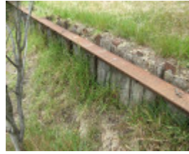
Westerfield_dam edge_KJ_Dec 08