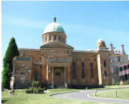
XAVIER COLLEGE SOHE 2008