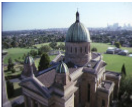
xavier college kew chapel aerial view