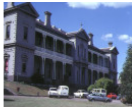
1 xavier college kew south wing front elevation