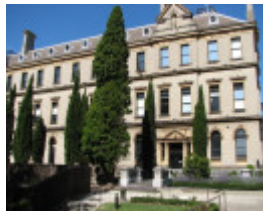
XAVIER COLLEGE SOHE 2008