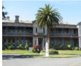
XAVIER COLLEGE SOHE 2008