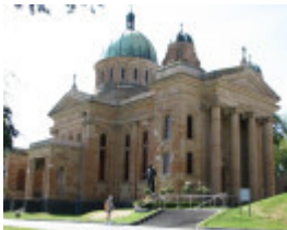
XAVIER COLLEGE SOHE 2008