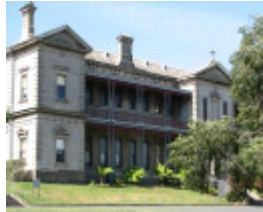
XAVIER COLLEGE SOHE 2008