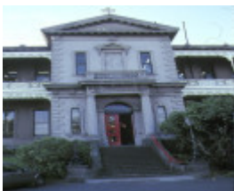
xavier college kew south wing entrance