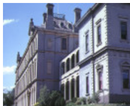
xavier college kew west wing front elevation