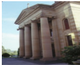
xavier college kew chapel entrance