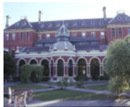
xavier college kew great hall front elevation may1990