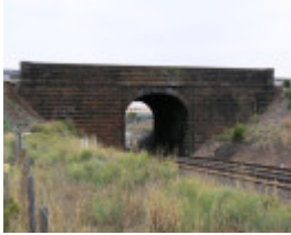
ROAD OVER RAIL BRIDGE SOHE 2008