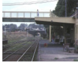
1 road bridge over railway line riddell road sunbury foot & road bridges feb1989