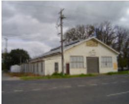
6168 Warragul Drill hall may07 ac 4