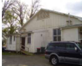
6168 Warragul Drill hall may07 ac 10