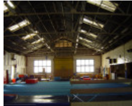
6168 Warragul Drill hall may07 ac 16