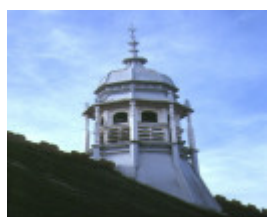
police station & former court house kew detail of tower