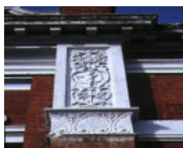
police station & former court house kew detail of attached pillar