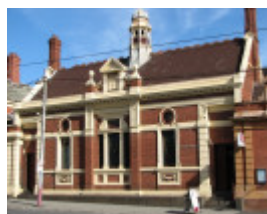
POLICE STATION AND FORMER COURT HOUSE SOHE 2008