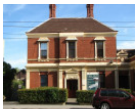
POLICE STATION AND FORMER COURT HOUSE SOHE 2008