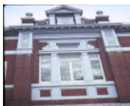
police station & former court house kew detail of front window