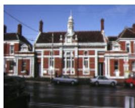
1 police station & former court house kew front view