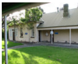
POLICE STATION AND FORMER COURT HOUSE SOHE 2008