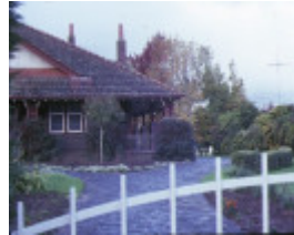
1 banool fitzroy street kilmore front view may1980