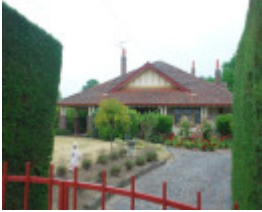
BANOOL SOHE 2008