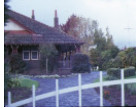
1 banool fitzroy street kilmore front view may1980