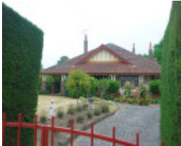
BANOOOL SOHE 2008