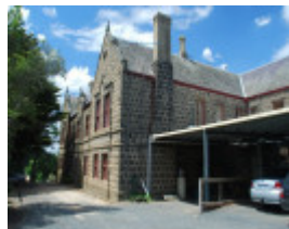
KILMORE DISTRICT HOSPITAL SOHE 2008