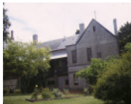
1 kilmore district hospital rutledge street kilmore rear view nov1997