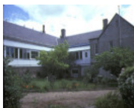
kilmore district hospital rutledge street kilmore hospital wing oct1985