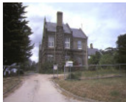
kilmore district hospital rutledge street kilmore entrance gate dec1984