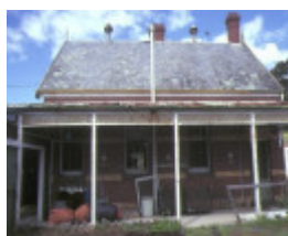
kilmore district hospital rutledge street kilmore infectious diseases oct1985