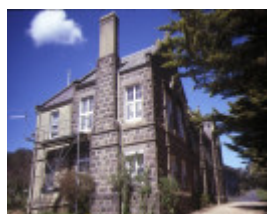
kilmore district hospital rutledge street kilmore side elevation oct1985