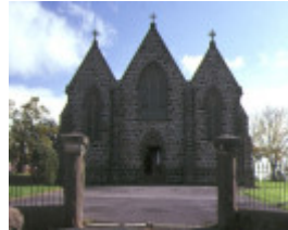
1 st patricks sutherland street kilmore front view may1989