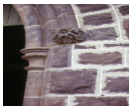
st patricks church sutherland street kilmore entrance archway detail may1989