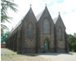
ST PATRICKS CHURCH SOHE 2008