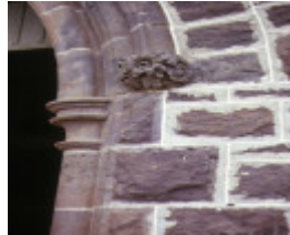
st patricks church sutherland street kilmore entrance archway detail may1989