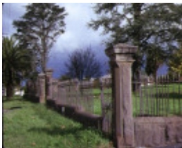
st patricks sutherland street kilmore surrounding fence may1989