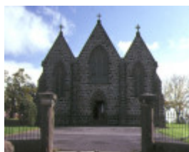
1 st patricks sutherland street kilmore front view may1989