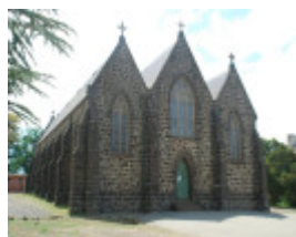
ST PATRICKS CHURCH SOHE 2008