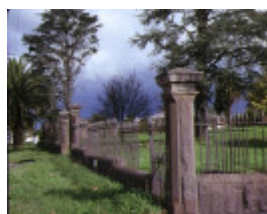
st patricks sutherland street kilmore surrounding fence may1989