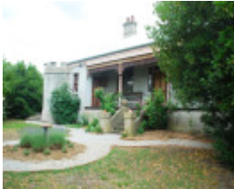
THE TOWERS SOHE 2008