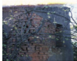
the towers victoria parade kilmore right hand tower may1983