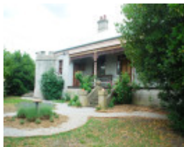
THE TOWERS SOHE 2008