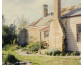
the towers victoria parade kilmore rear view cottage