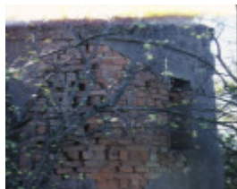
the towers victoria parade kilmore right hand tower may 1983