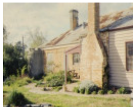
the towers victoria parade kilmore rear view cottage