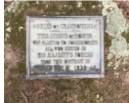
World War Two Memorial Plaque South Gippsland Highway