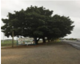
World War Two Memorial Planting South Gippsland Highway