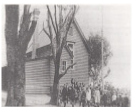
State School 128 Cedrus deodara St Andrews Black & White 2 - Shire of Eltham Heritage Study 1992