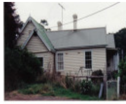
State School 128 Cedrus deodara St Andrews Colour 1 - Shire of Eltham Heritage Study 1992