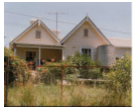
State School 128 Cedrus deodara St Andrews Colour 3 - Shire of Eltham Heritage Study 1992