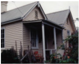
State School 128 Cedrus deodara St Andrews Colour 2 - Shire of Eltham Heritage Study 1992