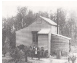
State School 128 Cedrus deodara St Andrews Black & White 1 - Shire of Eltham Heritage Study 1992