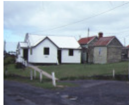
korumburra railway station complex station street korumburra outbuildings may1984