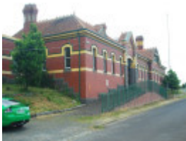
KORUMBURRA RAILWAY STATION COMPLEX SOHE 2008