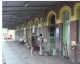
korumburra railway station complex station street korumburra platform view may1984