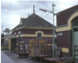
korumburra railway station complex station street korumburra station buildings may1984