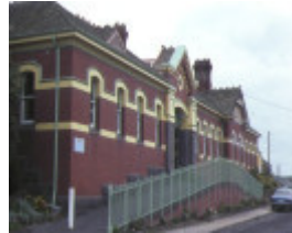
1 korumburra railway station compelx station street korumburra entrance may1984