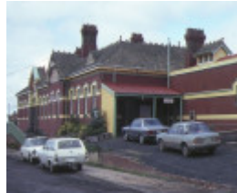
korumburra railway station complex station street korumburra front view may1984