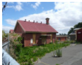
KYNETON DISTRICT HOSPITAL SOHE 2008