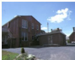
kyneton district hospital simpson street rear view