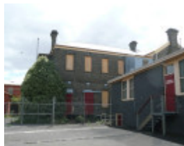
KYNETON DISTRICT HOSPITAL SOHE 2008