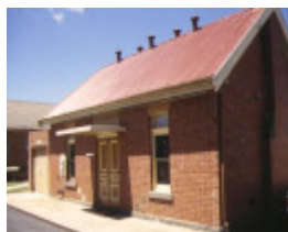
kyneton district hospital simpson street infectious diseases