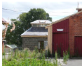
KYNETON DISTRICT HOSPITAL SOHE 2008