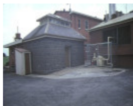
kyneton district hospital simpson street old morgue sep1984