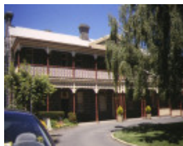
1 kyneton district hospital simpson street front view nov1997