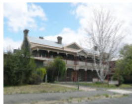
KYNETON DISTRICT HOSPITAL SOHE 2008