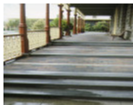
kyneton district hospital simpson street verandah oct1992