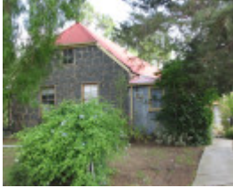
WUCHATSCH'S FARM SOHE 2008