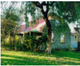
wutchach farm robert street thomastown side view publication