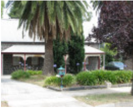
WUCHATSCH'S FARM SOHE 2008