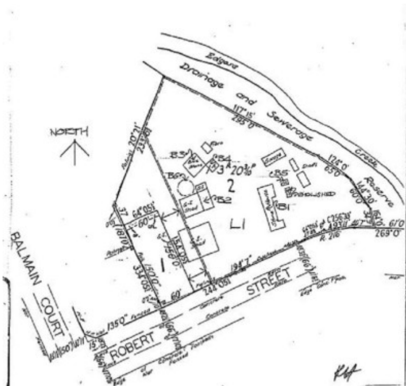
h00950 plan h0950