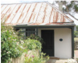
WUCHATSCH'S FARM SOHE 2008