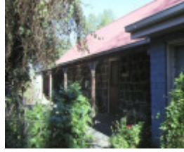
wutchach farm robert street thomastown verandah