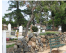
WUCHATSCH'S FARM SOHE 2008