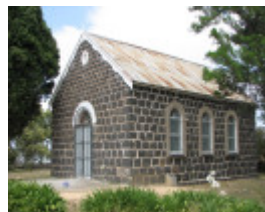
WUCHATSCH'S FARM SOHE 2008