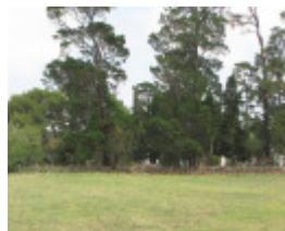
WUCHATSCH'S FARM SOHE 2008