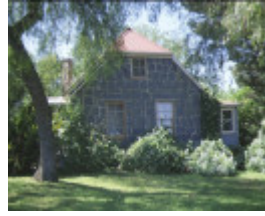
1 wutchach farm robert street thomastown front view