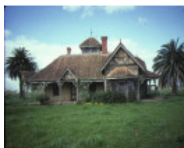
karlsruhe lancaster front view