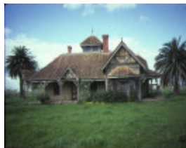
karlsruhe lancaster front view