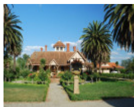
KARLSRUHE SOHE 2008