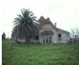
karlsruhe lancaster side view sep1983