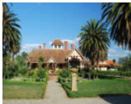
KARLSRUHE SOHE 2008