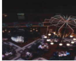
B2894 Rialto Building Laneway