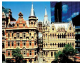
B2894 Rialto Building (on right)