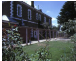
pirra homestead windermere road lara rear walkway & pergolas jan1985