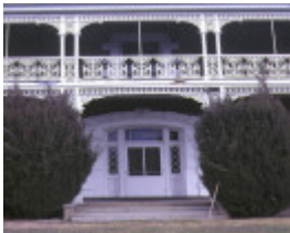
pirra homestead windermere road lara entrance sep1982