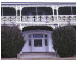
pirra homestead windermere road lara entrance sep1982