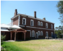
PIRRA HOMESTEAD SOHE 2008