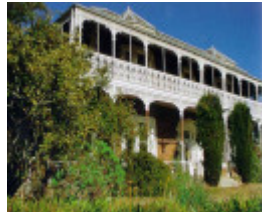
pirra homestead windermere road lara front view publication