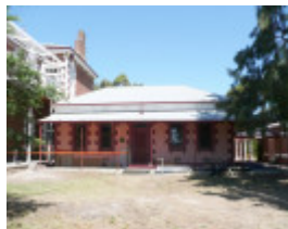
PIRRA HOMESTEAD SOHE 2008