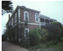
pirra homestead windermere road lara side view sep1984