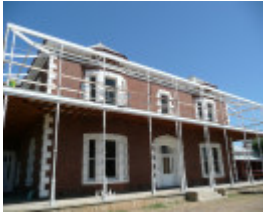
PIRRA HOMESTEAD SOHE 2008