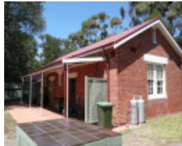
PIRRA HOMESTEAD SOHE 2008