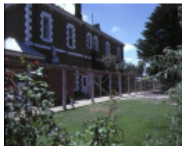
pirra homestead windermere road lara rear walkway & pergolas jan1985