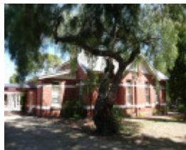
PIRRA HOMESTEAD SOHE 2008