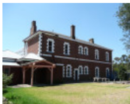
PIRRA HOMESTEAD SOHE 2008