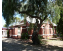
PIRRA HOMESTEAD SOHE 2008