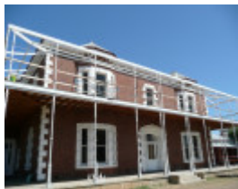
PIRRA HOMESTEAD SOHE 2008