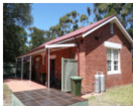
PIRRA HOMESTEAD SOHE 2008