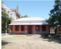
PIRRA HOMESTEAD SOHE 2008