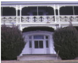
pirra homestead windermere road lara entrance sep1982