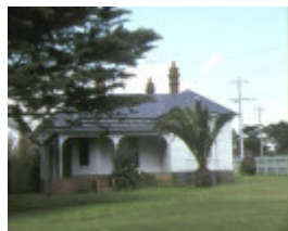
st marks on the hill leopold vicarage