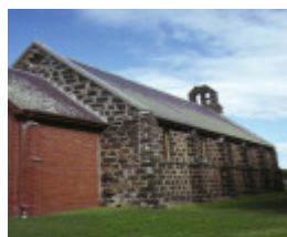
st marks on the hill leopold rear view