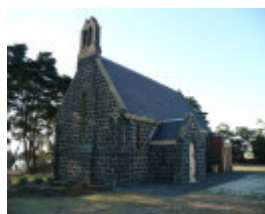
ST MARKS ON THE HILL SOHE 2008