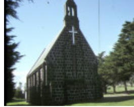
1 st marks on the hill leopold front view