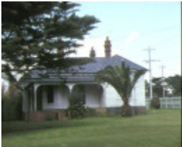
st marks on the hill leopold vicarage