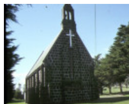
1 st marks on the hill leopold front view