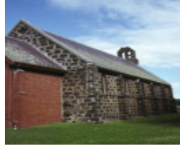
st marks on the hill leopard rear view