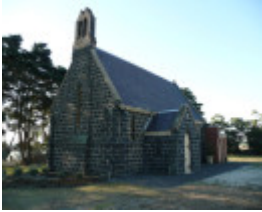
ST MARKS ON THE HILL SOHE 2008