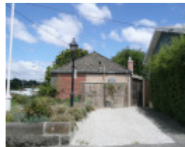
MONTROSE COTTAGE SOHE 2008