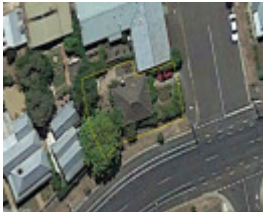
Montrose Cottage aerial diagram