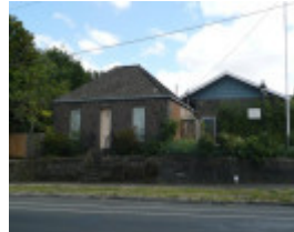
MONTROSE COTTAGE SOHE 2008