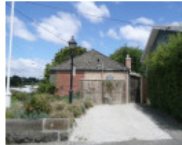
MONTROSE COTTAGE SOHE 2008