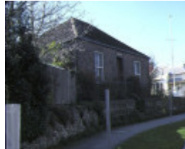
1 montrose cottage ballarat front view