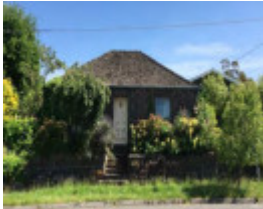
Montrose Cottage 2020