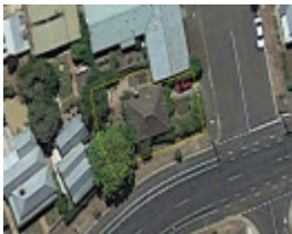
Montrose Cottage aerial diagram