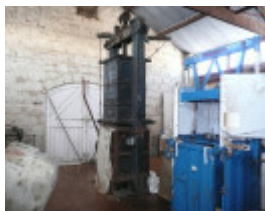
TITANGA HOMESTEAD SOHE 2008