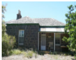
TITANGA HOMESTEAD SOHE 2008