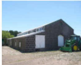
TITANGA HOMESTEAD SOHE 2008