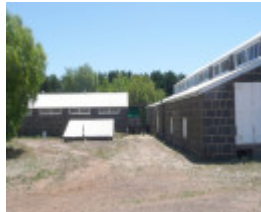
TITANGA HOMESTEAD SOHE 2008