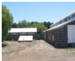
TITANGA HOMESTEAD SOHE 2008