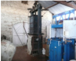
TITANGA HOMESTEAD SOHE 2008