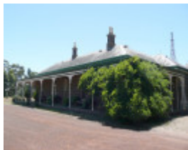
TITANGA HOMESTEAD SOHE 2008