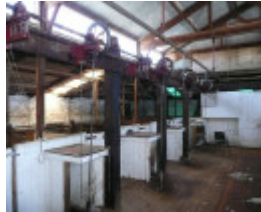
TITANGA HOMESTEAD SOHE 2008