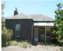
TITANGA HOMESTEAD SOHE 2008