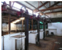
TITANGA HOMESTEAD SOHE 2008