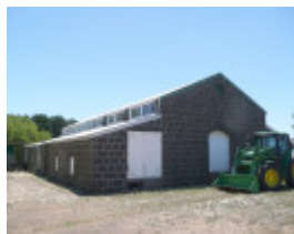
TITANGA HOMESTEAD SOHE 2008