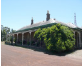
TITANGA HOMESTEAD SOHE 2008