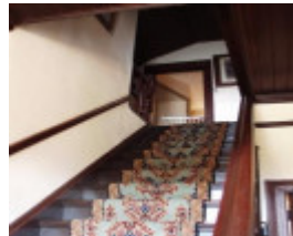
B1403 Ballam Park