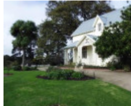
B1403 Ballam Park