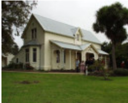
B1403 Ballam Park