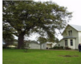
B1403 Ballam Park