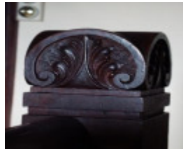
B1403 Ballam Park