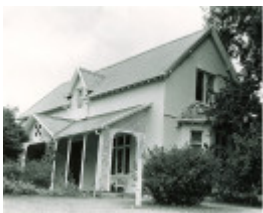
B1403 Ballam Park