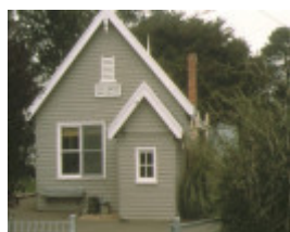
little hampton primary school no 1700 side view