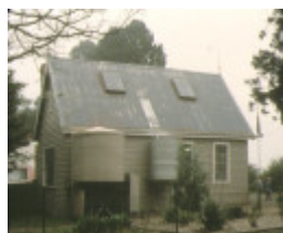
little hampton primary school no 1700 rear view