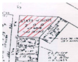
little hampton school plan