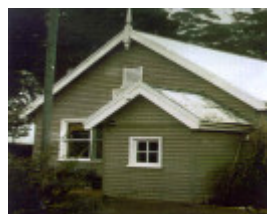
1 little hampton primary school no 1700 front view