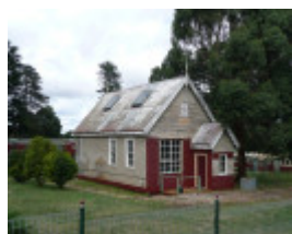
LITTLE HAMPTON PRIMARY SCHOOL NO. 1700 SOHE 2008