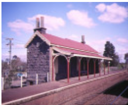
little river railway station & goods yard school road little river trackside view aug1997