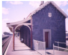
little river station & goods yard school road little river platform side view aug1997