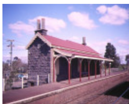
little river railway station & goods yard school road little river trackside view aug1997