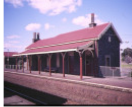
1 little river railway station & goods yard school-road little river platform view aug1997