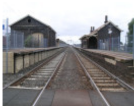
LITTLE RIVER RAILWAY STATION AND GOODS YARD SOHE 2008