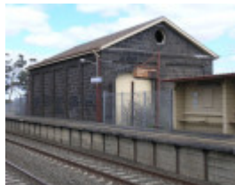
LITTLE RIVER RAILWAY STATION AND GOODS YARD SOHE 2008