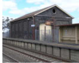
LITTLE RIVER RAILWAY STATION AND GOODS YARD SOHE 2008