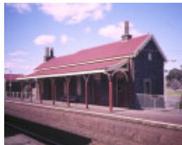
1 little river railway station & goods yard school-road little river platform view aug1997