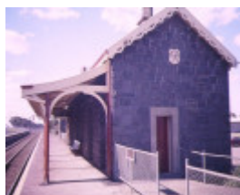
little river station & goods yard school road little river platform side view aug1997