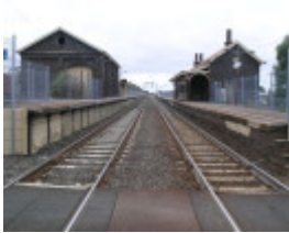
LITTLE RIVER RAILWAY STATION AND GOODS YARD SOHE 2008