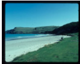
CAPE BRIDGEWATER ROAD, GREAT SOUTH WEST WALK, CAPE BRIDGEWATER