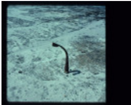
CAPE BRIDGEWATER ROAD, GREAT SOUTH WEST WALK, CAPE BRIDGEWATER FEATURE