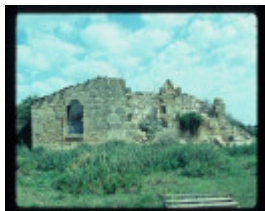
NATIONAL SCHOOL NO.741 FEATURE