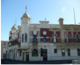
THE PROVINCIAL HOTEL SOHE 2008