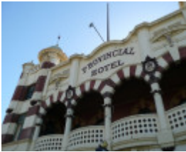
THE PROVINCIAL HOTEL SOHE 2008