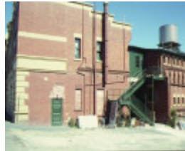
provincial hotel ballarat rear view feb1990