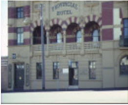
provincial hotel ballarat detail balcony feb1990