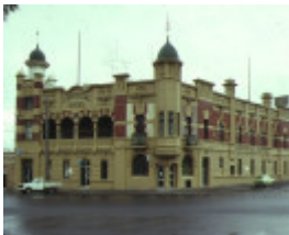
1 provincial hotel ballarat front view sep1990