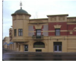
provincial hotel ballarat view tower sep1989