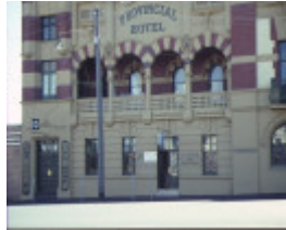
provincial hotel ballarat detail balcony feb1990