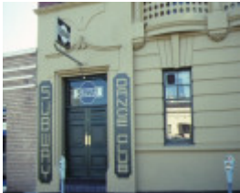
provincial hotel ballarat entrance