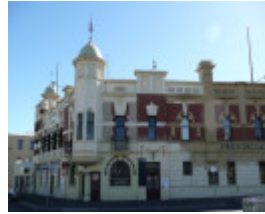
THE PROVINCIAL HOTEL SOHE 2008