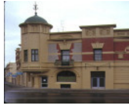
provincial hotel ballarat view tower sep1989