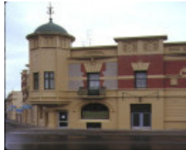
provincial hotel ballarat view tower sep1989