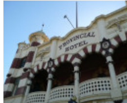
THE PROVINCIAL HOTEL SOHE 2008