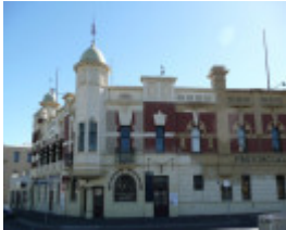
THE PROVINCIAL HOTEL SOHE 2008