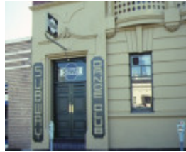
provincial hotel ballarat entrance