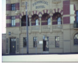
provincial hotel ballarat detail balcony feb1990