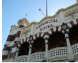
THE PROVINCIAL HOTEL SOHE 2008