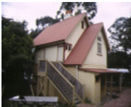
primary school no 2162 grove road lorne residence mar1998