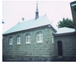
primary school no 2162 grove road lorne side elevation jul1984