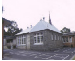
1 primary school no 2162 grove road lorne yard view mar1998