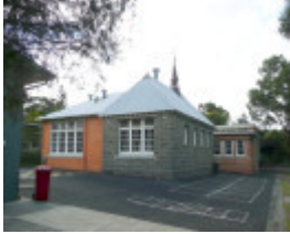
PRIMARY SCHOOL NO.2162 SOHE 2008