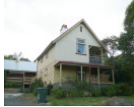
PRIMARY SCHOOL NO.2162 SOHE 2008