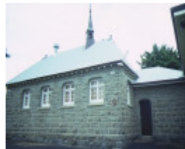
primary school no 2162 grove road lorne side elevation jul1984