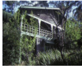
leighwood mountjoy parade lorne side view mar1985