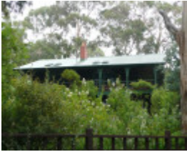
LEIGHWOOD SOHE 2008