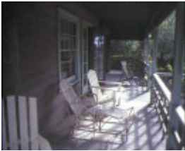
leighwood mountjoy parade lorne verandah mar1985