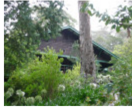
LEIGHWOOD SOHE 2008