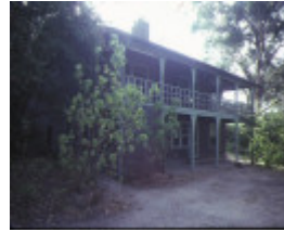
1 leighwood mountjoy parade lorne front view mar1985