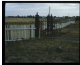
SEXTON'S COTTAGE SITE, SOUTH PORTLAND CEMETERY