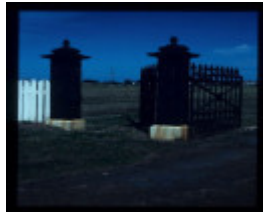
SEXTON'S COTTAGE SITE, SOUTH PORTLAND CEMETERY