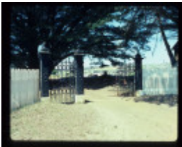
SEXTON'S COTTAGE SITE, SOUTH PORTLAND CEMETERY