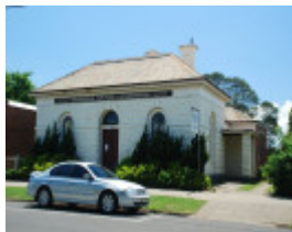
NATIONAL AUSTRALIA BANK SOHE 2008