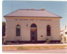
h00399 1 national bank maffra 1977