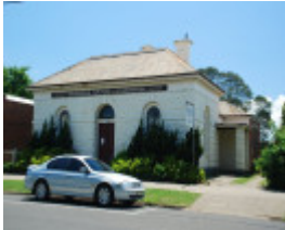
NATIONAL AUSTRALIA BANK SOHE 2008