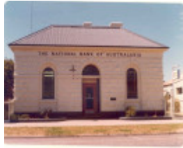
h00399 1 national bank maffra 1977