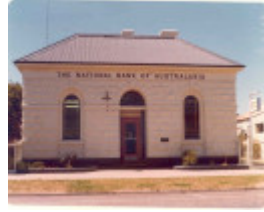
h00399 1 national bank maffra 1977