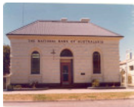
h00399 1 national bank maffra 1977