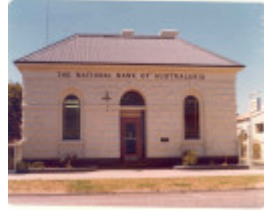
h00399 1 national bank maffra 1977