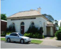
NATIONAL AUSTRALIA BANK SOHE 2008