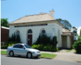
NATIONAL AUSTRALIA BANK SOHE 2008