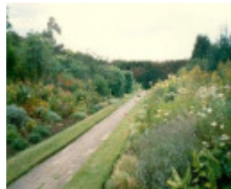
B1381 Coombe Cottage Garden