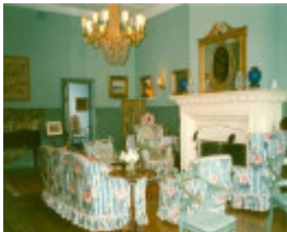
B1381 Coombe Cottage Music Room