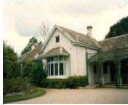
B1381 Coombe Cottage