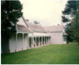
B1381 Coombe Cottage