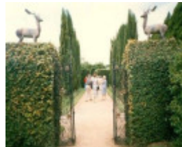
B1381 Coombe Cottage Garden