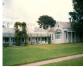
B1381 Coombe Cottage