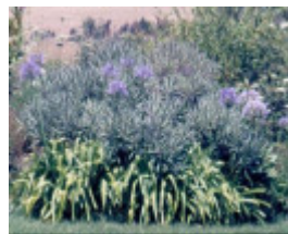
B3517 Gulf Station Garden