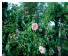
B3517 Gulf Station Garden