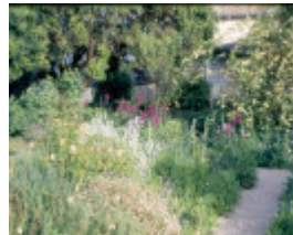
B3517 Gulf Station Garden