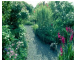
B3517 Gulf Station Garden