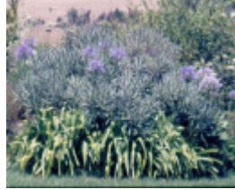
B3517 Gulf Station Garden