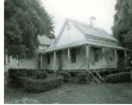
B3517 Gulf Station