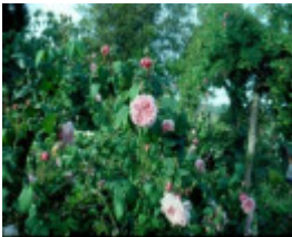
B3517 Gulf Station Garden