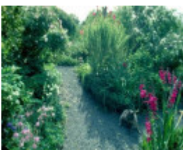
B3517 Gulf Station Garden