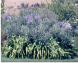
B3517 Gulf Station