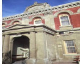
maldon district hospital chapel street maldon detail of front entrance aug1984