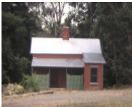
maldon district hospital chapel street maldon isolation ward dec1997