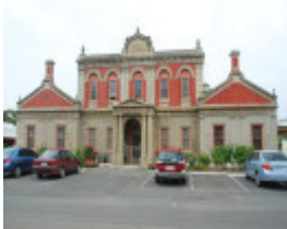
MALDON DISTRICT HOSPITAL SOHE 2008