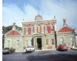
1 maldon district hospital chapel street maldon front elevation aug1984