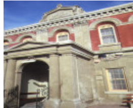
maldon district hospital chapel street maldon detail of front entrance aug1984