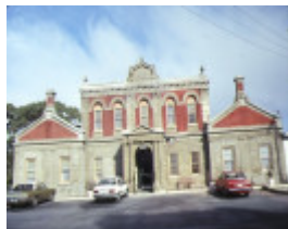
1 maldon district hospital chapel street maldon front elevation aug1984