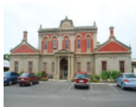
MALDON DISTRICT HOSPITAL SOHE 2008