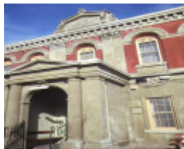
maldon district hospital chapel street maldon detail of front entrance aug1984