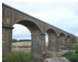
MALMSBURY RAIL BRIDGE SOHE 2008