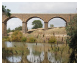
MALMSBURY RAIL BRIDGE