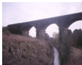
rail bridge over coliban river malmsbury side view apr1995