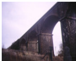
1 rail bridge over coliban river malmsbury side elevation apr1995