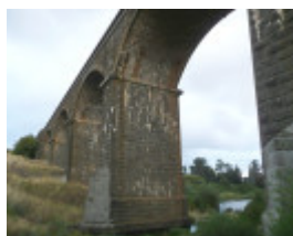
MALMSBURY RAIL BRIDGE SOHE 2008