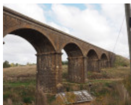
MALMSBURY RAIL BRIDGE 2020