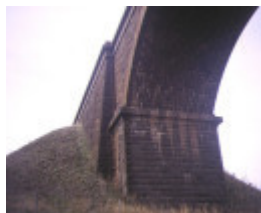
rail bridge over coliban river malmsbury detail of arch apr1995