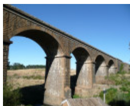
MALMSBURY RAIL BRIDGE SOHE 2008