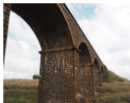
MALMSBURY RAIL BRIDGE 2020