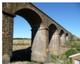
MALMSBURY RAIL BRIDGE SOHE 2008