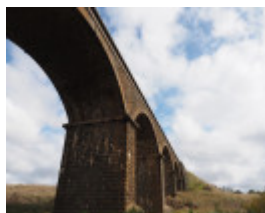
MALMSBURY RAIL BRIDGE 2020