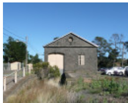
MALMSBURY RAILWAY STATION SOHE 2008