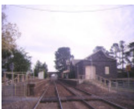
malmsbury railway station malmsbury daylesford road side view apr1995