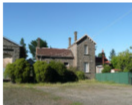
MALMSBURY RAILWAY STATION SOHE 2008