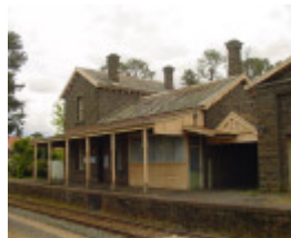
Malmsbury Station Building South