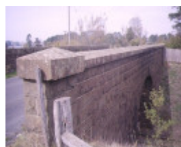
malmsbury railway station malmsbury daylesford bridge apr1995