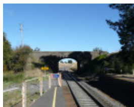
MALMSBURY RAILWAY STATION SOHE 2008