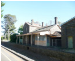
MALMSBURY RAILWAY STATION SOHE 2008