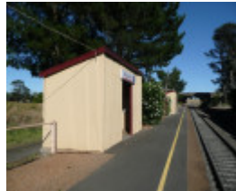
MALMSBURY RAILWAY STATION SOHE 2008