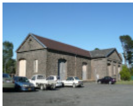
MALMSBURY RAILWAY STATION SOHE 2008