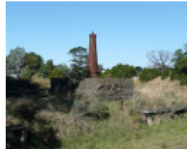
MALMSBURY RAILWAY STATION SOHE 2008