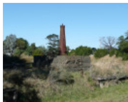
MALMSBURY RAILWAY STATION SOHE 2008