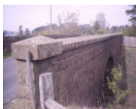
malmsbury railway station malmsbury daylesford bridge apr1995