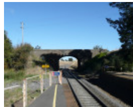
MALMSBURY RAILWAY STATION SOHE 2008