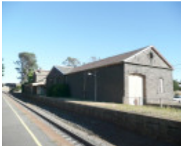
MALMSBURY RAILWAY STATION SOHE 2008