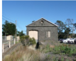
MALMSBURY RAILWAY STATION SOHE 2008