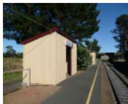
MALMSBURY RAILWAY STATION SOHE 2008