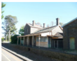
MALMSBURY RAILWAY STATION SOHE 2008