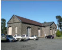
MALMSBURY RAILWAY STATION SOHE 2008