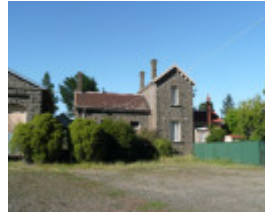
MALMSBURY RAILWAY STATION SOHE 2008