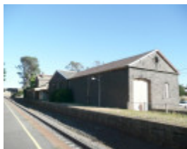
MALMSBURY RAILWAY STATION SOHE 2008