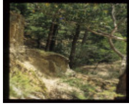
MAFEKING ALLUVIAL WORKINGS