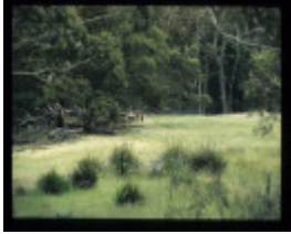
MAFEKING ALLUVIAL WORKINGS