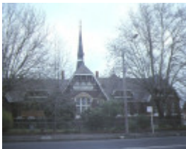
1 malvern primary school no 2586 tooronga road malvern front view