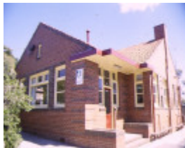
malvern primary school no 2586 tooronga road malvern domestic arts building