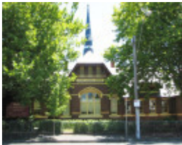
PRIMARY SCHOOL NO.2586 SOHE 2008