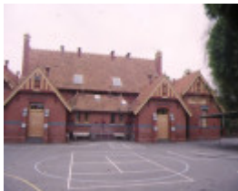
malvern primary school no 2586 tooronga road malvern infants school dec 97