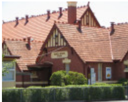
PRIMARY SCHOOL NO.2586 SOHE 2008