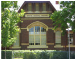
PRIMARY SCHOOL NO.2586 SOHE 2008