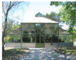
CENTRAL PARK CONSERVATORY SOHE 2008