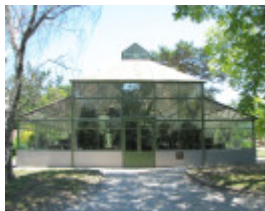
CENTRAL PARK CONSERVATORY SOHE 2008