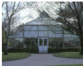
1 central park conservatory wattletree road malvern front view