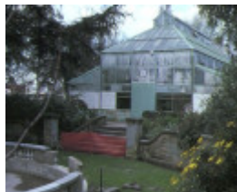
central park conservatory wattletree road malvern rear view