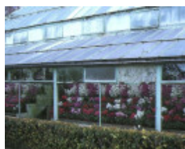
central park conservatory wattle tree road malvern side view