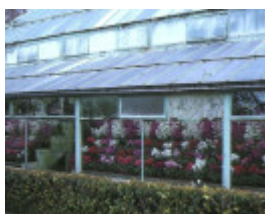
central park conservatory wattletree road malvern side view