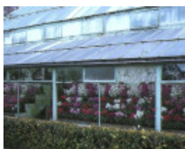
central park conservatory wattle tree road malvern side view